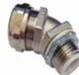
45° - NPT Thread 3/8" through 1"