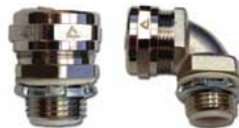
Straight and 90° - NPT Thread 3/8" through 2"